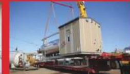
48" X 20" 2000psi Treater