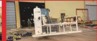
36" x 10' 275psi Inlet Scrubber for Permian Basin